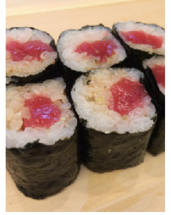
Tekka maki desu-ka? Is this Tuna Roll?