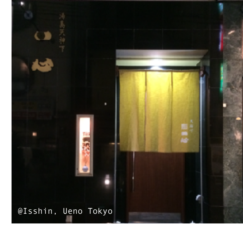
@Isshin, Ueno Tokyo