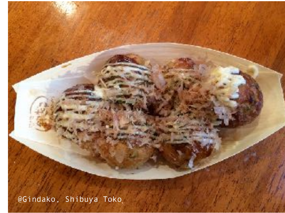
@Gindako, Shibuya Toko.

Same as English pronunciation, Ka will end with little higher note.