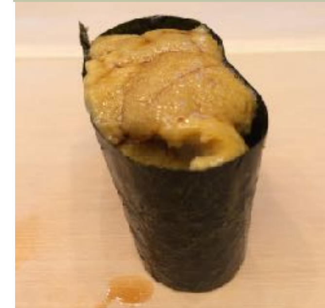
Kore wa nann desu-ka? これはなんですか？

Nann =What. You can simply replace the noun from the other sentence, replacing the takoyaki with nann(what) to ask simply ask what is this.