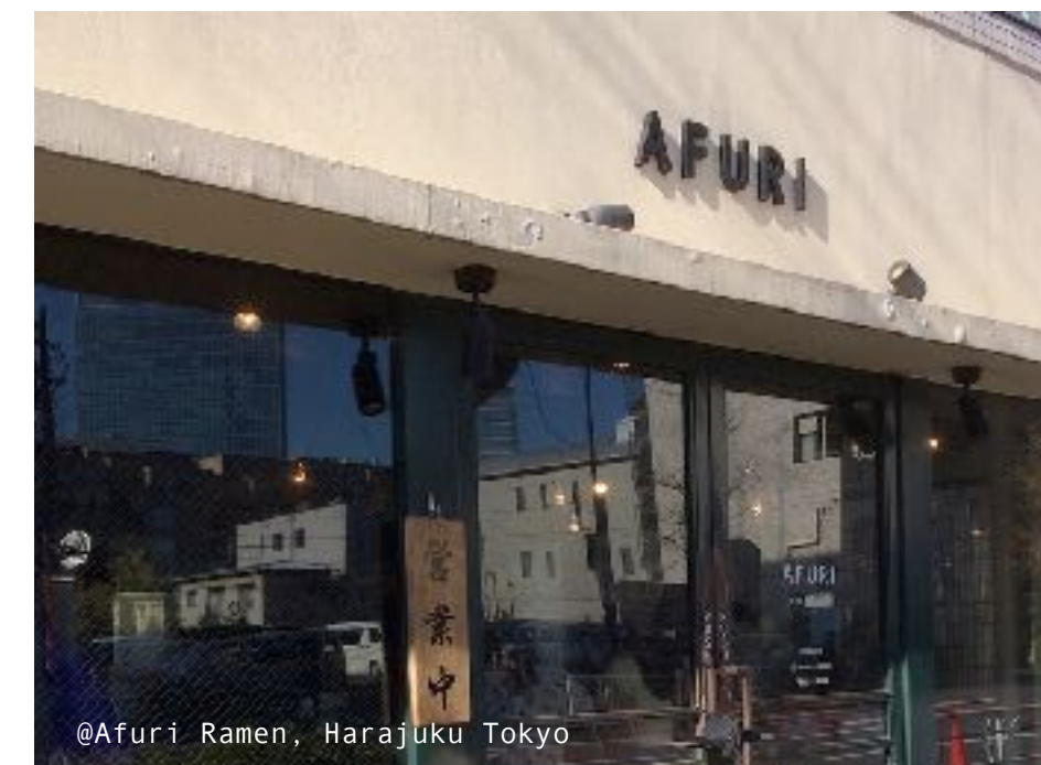
@Afuri Ramen, Harajuku Tokyo Kore wa Ramen-ya desu. This is Ramen Restaurant.