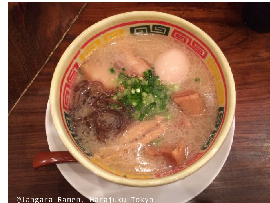
@Jangara Ramen, Harajuku Tokyo Kore wa Tonkotsu Ramen desu. This is Tonkotsu Ramen.

A “Wa” + B ”desu” is the simplest form of sentence to say “A” is “B”.