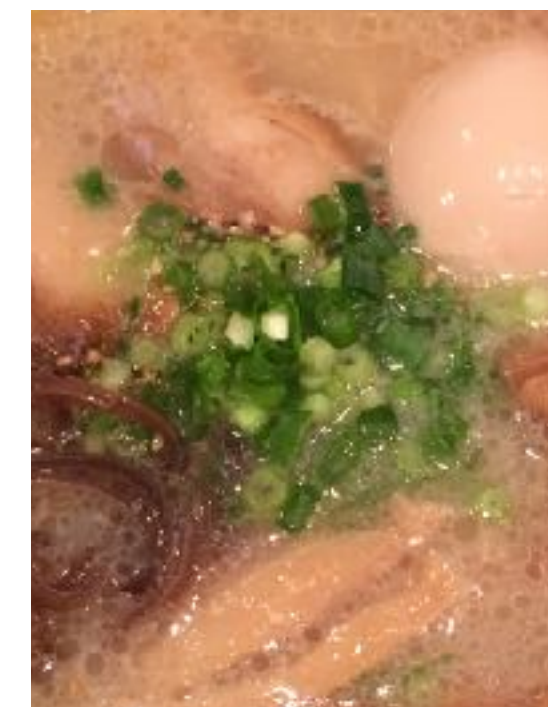
Kore wa Negi (desu). This is leek.