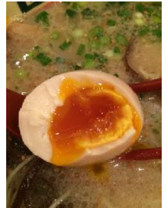
Kore wa Tamago (desu). This is Egg.