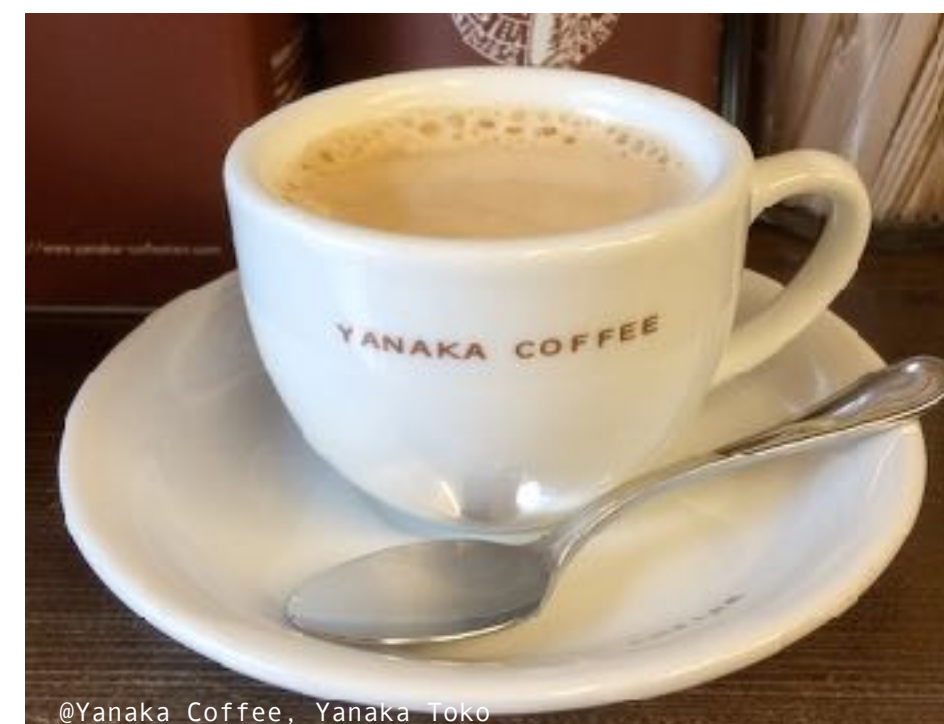
@Yanaka Coffee, Yanaka Tokyo Kore wa Ko-hee desu. This is Coffee.

Watashi wa Foodie desu. Watashi wa Foodie. desu I am foodie*.